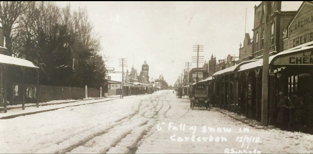
‘6” Fall of Snow in Carterton’, Carterton High Street, 1918

TO DISCOVER, UNDERSTAND, RESPECT, VALUE AND SHARE OUR COMMUNITY'S YESTERDAYS