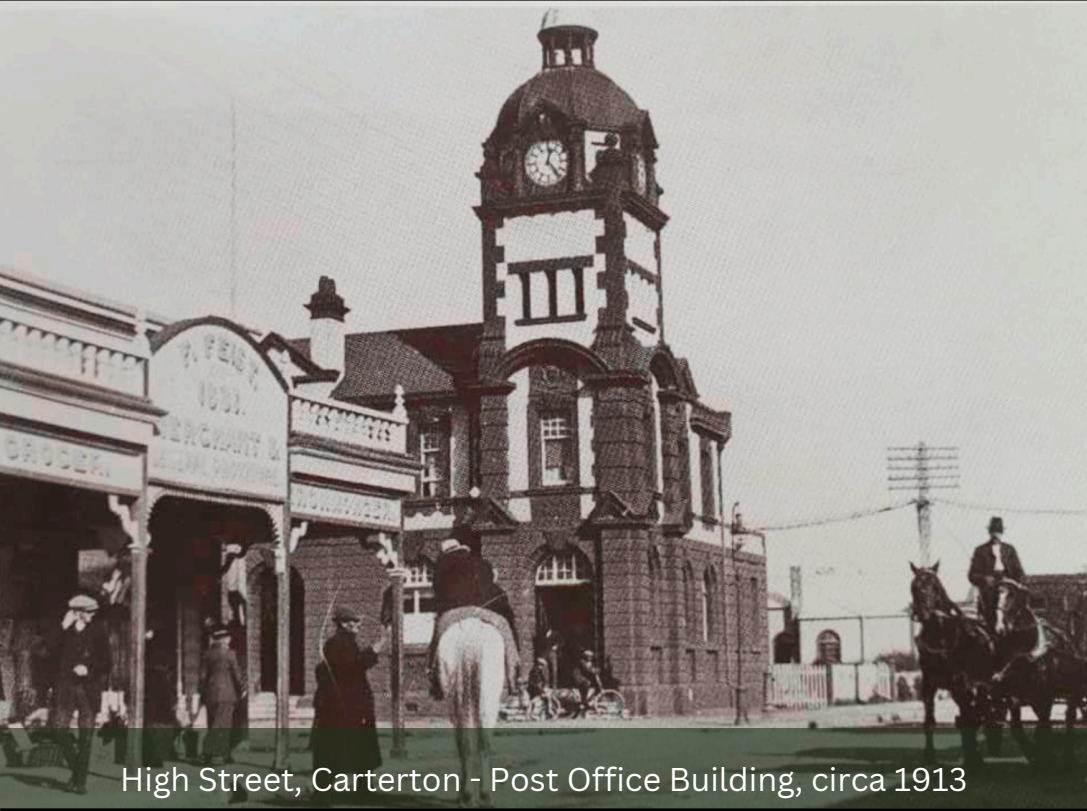
High Street, Carterton - Post Office Building, circa 1913