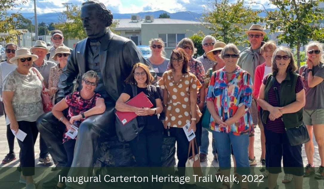
Inaugural Carterton Heritage Trail Walk, 2022