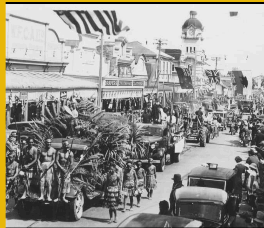
High Street, Carterton - Kings Coronation, 1937