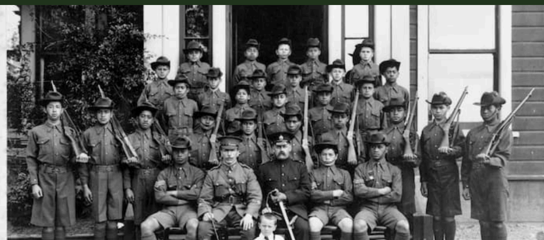
School Cadets - Hikurangi College, Clareville, 1900 - 1920

Established in 1987, the Carterton District Historical Society (CDHS) comprises of a collection of enthusiasts who are interested in uncovering, preserving and sharing the history of Carterton – it's places, buildings, people, businesses, social & sporting groups and events. Our archive holds records of local historical photographs, memorabilia, regional maps, artefacts, histories of individual local businesses, school rolls, churches, Clareville cemetery records and the history of Carterton's early European settlers.