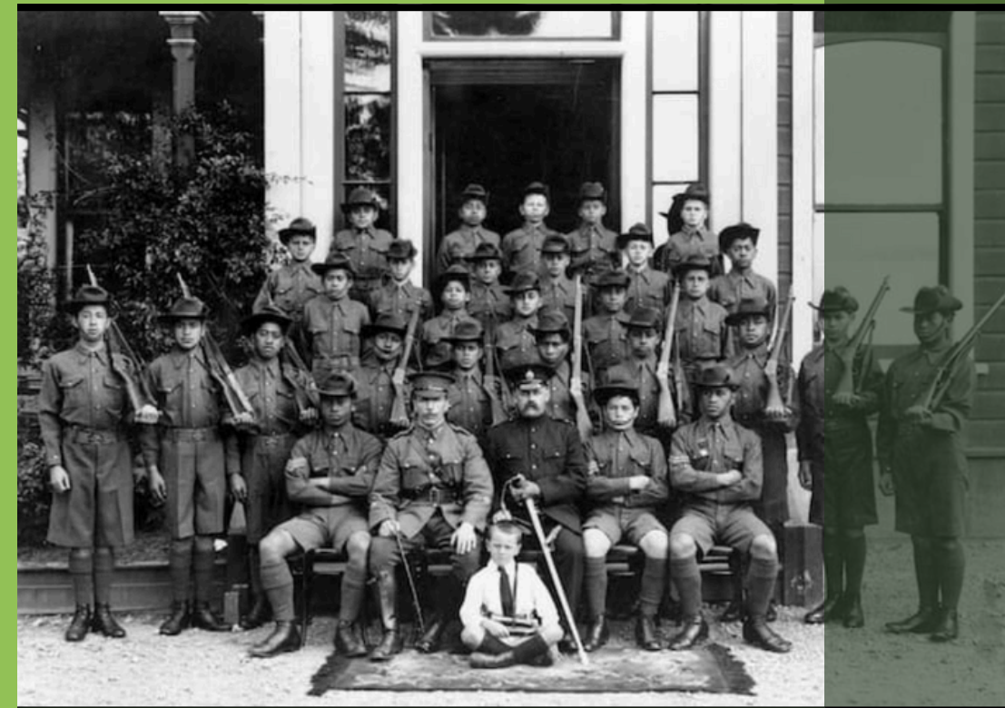
School Cadets - Hikurangi College, Clareville, 1900 - 1920