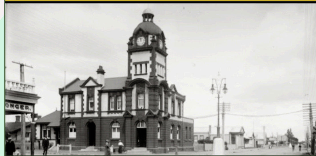
Carterton Post Office, Carterton High Street, 1913

TO DISCOVER, UNDERSTAND, RESPECT, VALUE AND SHARE OUR COMMUNITY'S YESTERDAYS