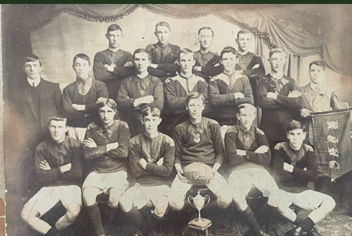
Rovers Jnr. Football Team, 1905

Established in 1987, the Carterton District Historical Society (CDHS) comprises of a collection of enthusiasts who are interested in uncovering, preserving and sharing the history of Carterton – it's places, buildings, people, businesses, social & sporting groups and events. Our archive holds records of local historical photographs, memorabilia, regional maps, artefacts, histories of individual local businesses, school rolls, churches, Clareville cemetery records and the history of Carterton's early European settlers.