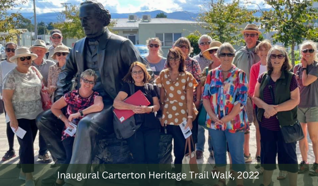
Inaugural Carterton Heritage Trail Walk, 2022