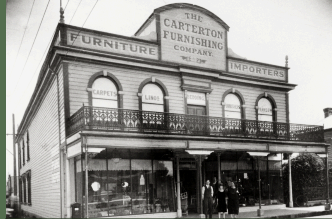
Carterton Furnishing Company, Carterton High Street, circa 1947